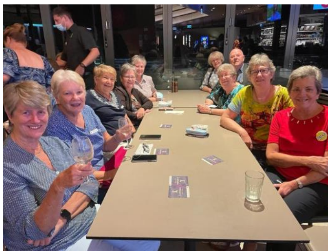
Sunday Night Drinks