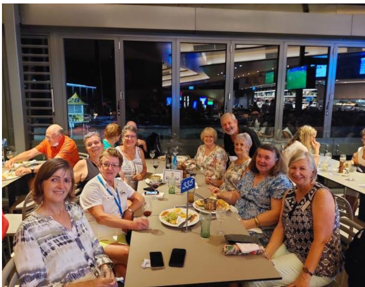
Saturday Night Drinks