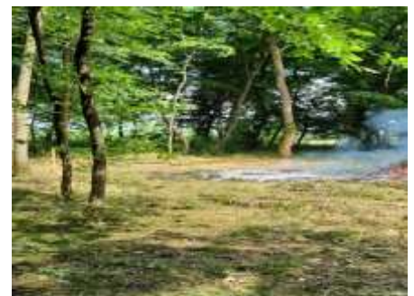
Forest Clearing for House