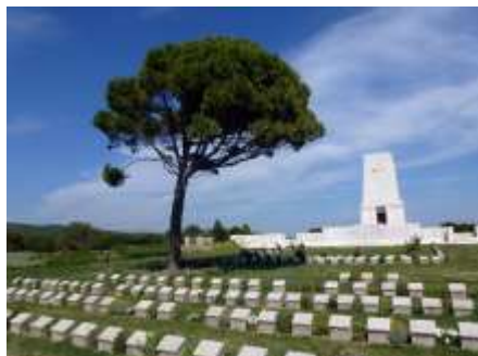
Lone Pine, Gallipoli