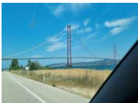
1915 Çanakkale Bridge