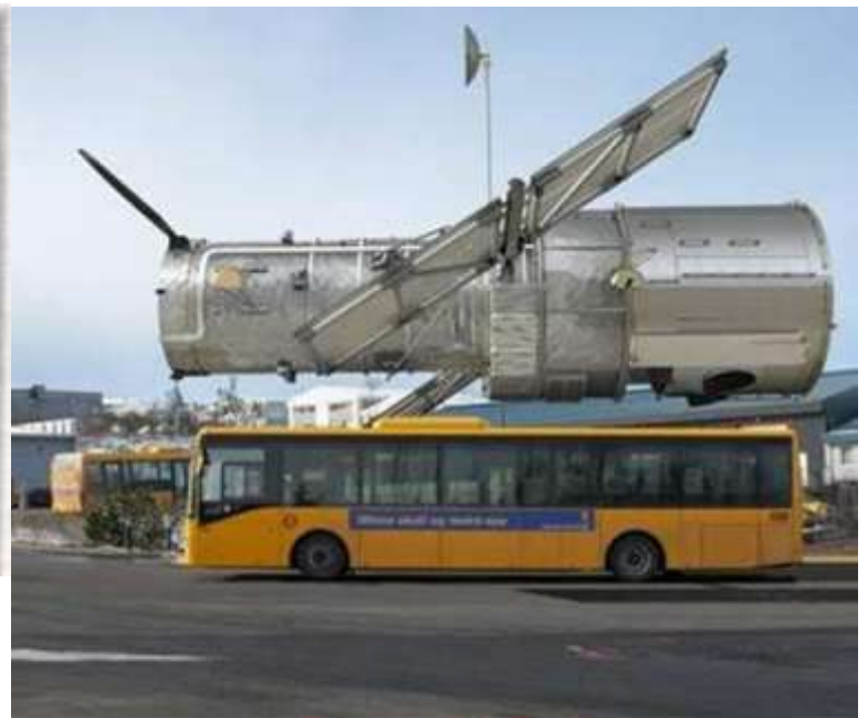
This is the size of the Hubble Space Telescope, in case you ever wondered.

MOTHER IN LAW CAME FOR DINNER AND SAID "WHY DOES YOUR DOG KEEP LOOKING AT ME" I SAID "IT'S BECAUSE YOU'RE USING HIS PLATE"