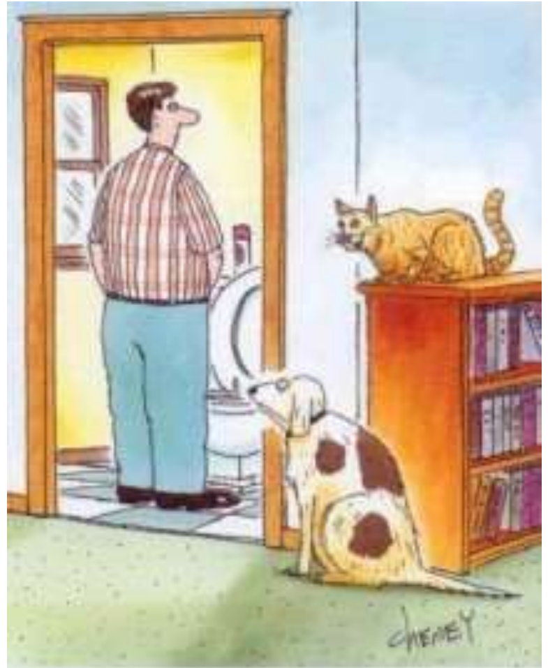
"So, if you're his best friend, then why is he always peeing in your drinking water?"

MOTHER IN LAW CAME FOR DINNER AND SAID "WHY DOES YOUR DOG KEEP LOOKING AT ME" I SAID "IT'S BECAUSE YOU'RE USING HIS PLATE"