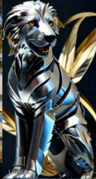
An AI generated statue of Sandy