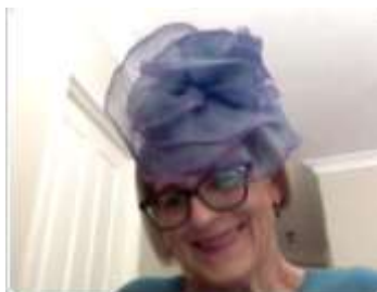
1st MariaCh 100pp