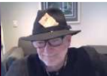
Best man ColMor 50pp