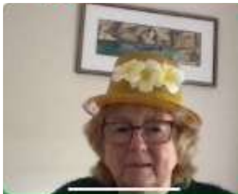
2nd: KayR 55 PPs