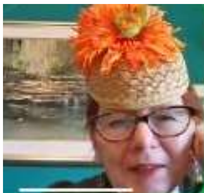
1st: PamelaLi 110 PPs